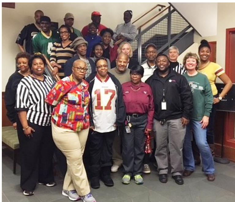
The winning team: Group photo of READ students, teachers, tutors, and staff at the annual Super Bowl Tailgate Celebration in February.

Wednesday, May 3, 2017 · 6:00pm Team/Volunteer Reception · 7:00pm Let the Games Begin! Visit our website www.readcenter.org to purchase tickets online.